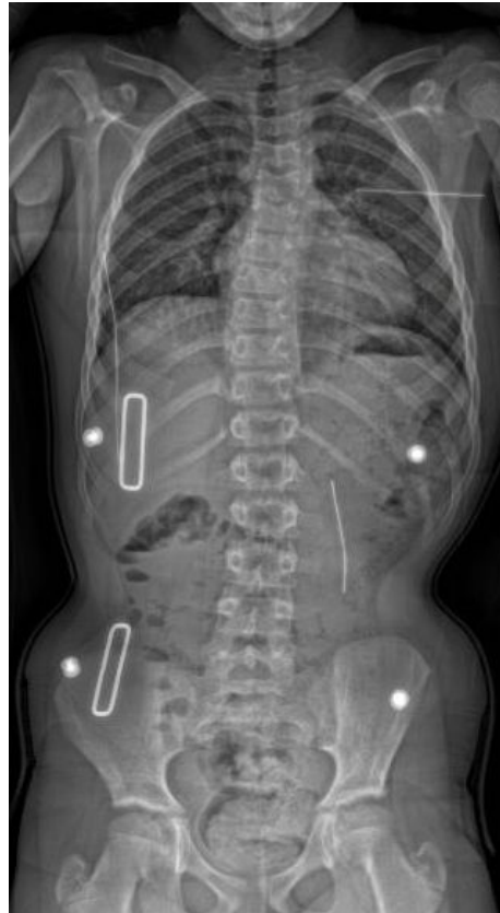
With WRC Brace